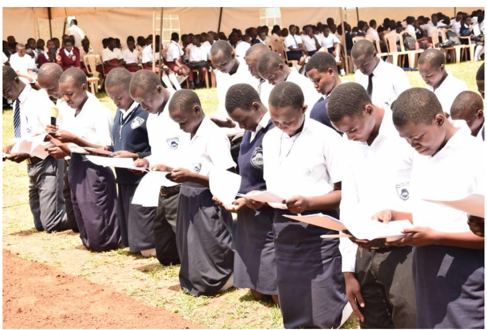
Young Christian Students (YCS) member enrollment