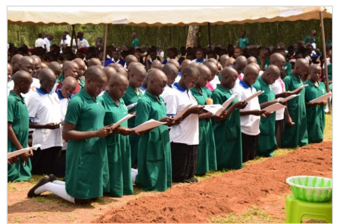
Praying for a fruitful tenure of the new YCS management