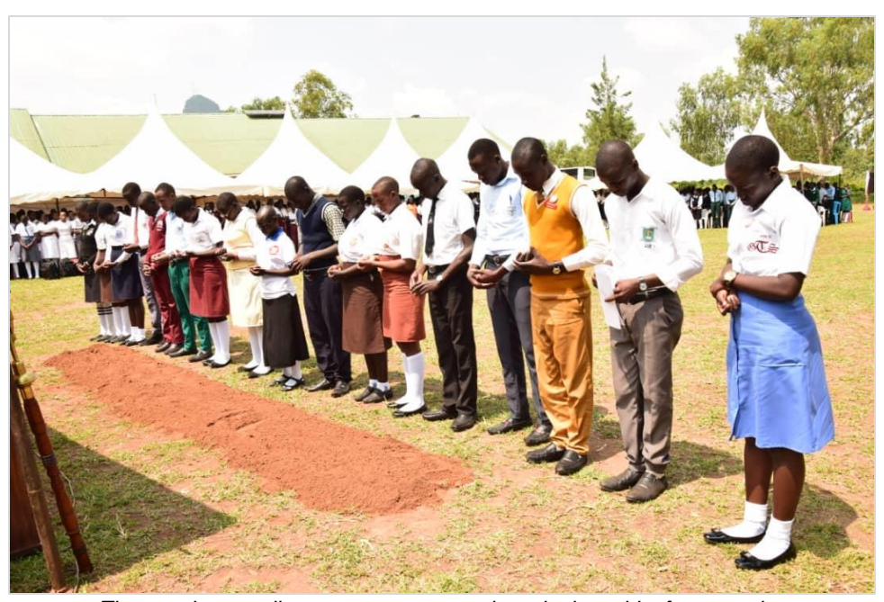
The member enrollment encourages students in the spirit of community.