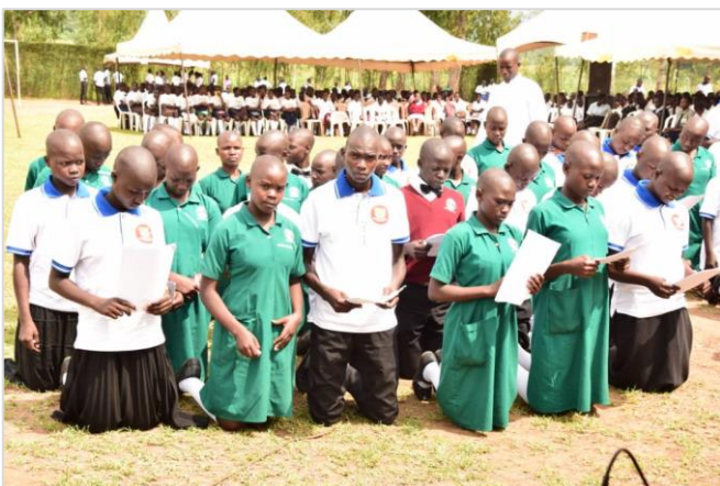
Blessing the new members of the club