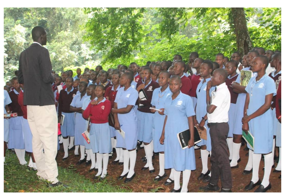
Students being addressed by a guide at the Kasaku Tea Estates