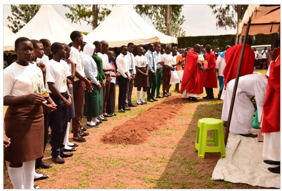
Another moment from enrollment day