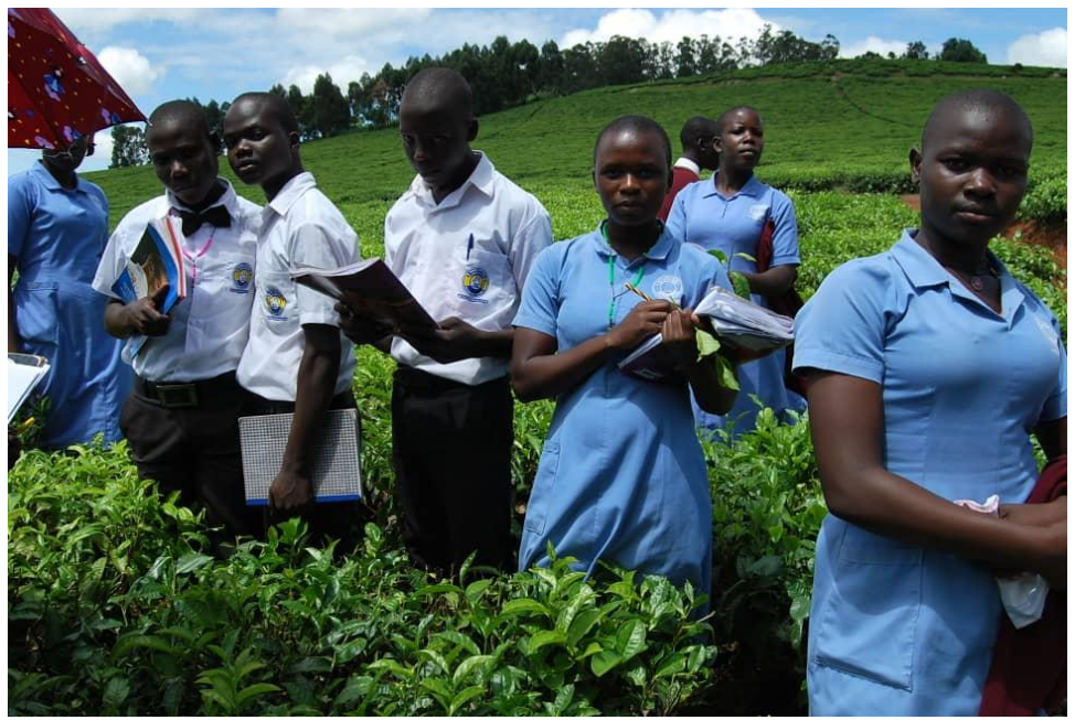
Senior four students during the Kasaku Tea Estates field tour