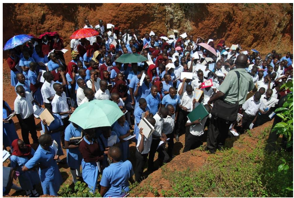
The geography trip is a mandatory requirement for students, as it is covered during their final examinations.