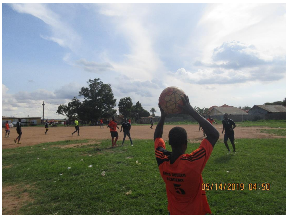
A throw-in during the match