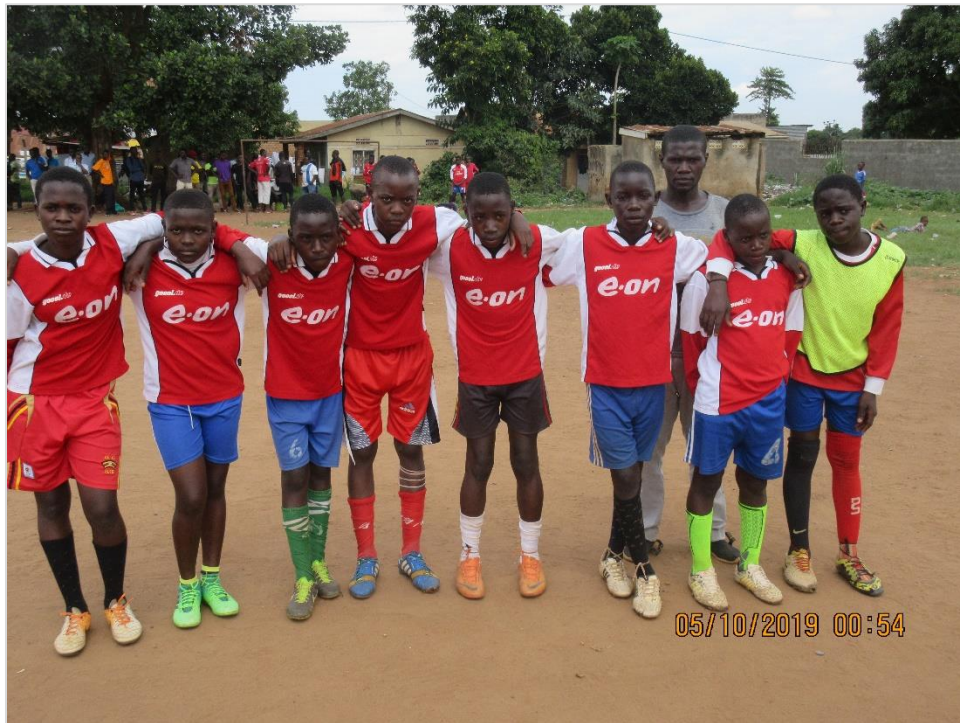
A team of under-17 Buwate boys and girls before a match