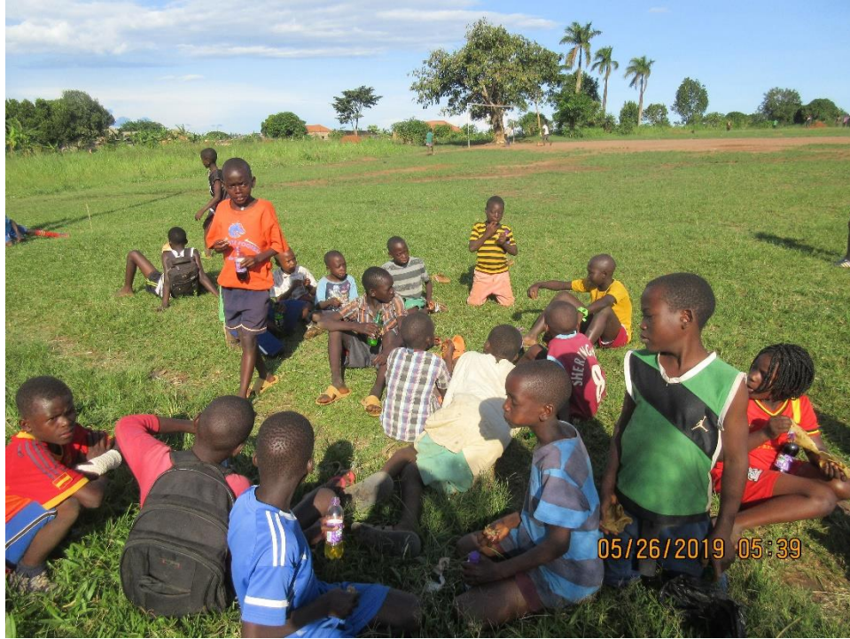
Relaxing with their sodas