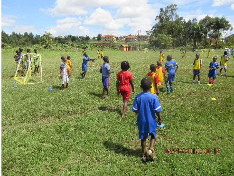
Children participating in the game