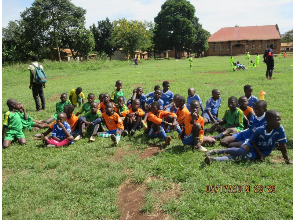
Children sitting as they wait for final information from the organizers