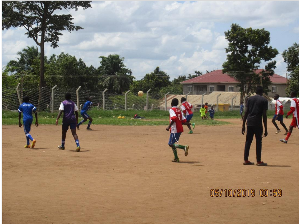
Both boys and girls during a friendly match