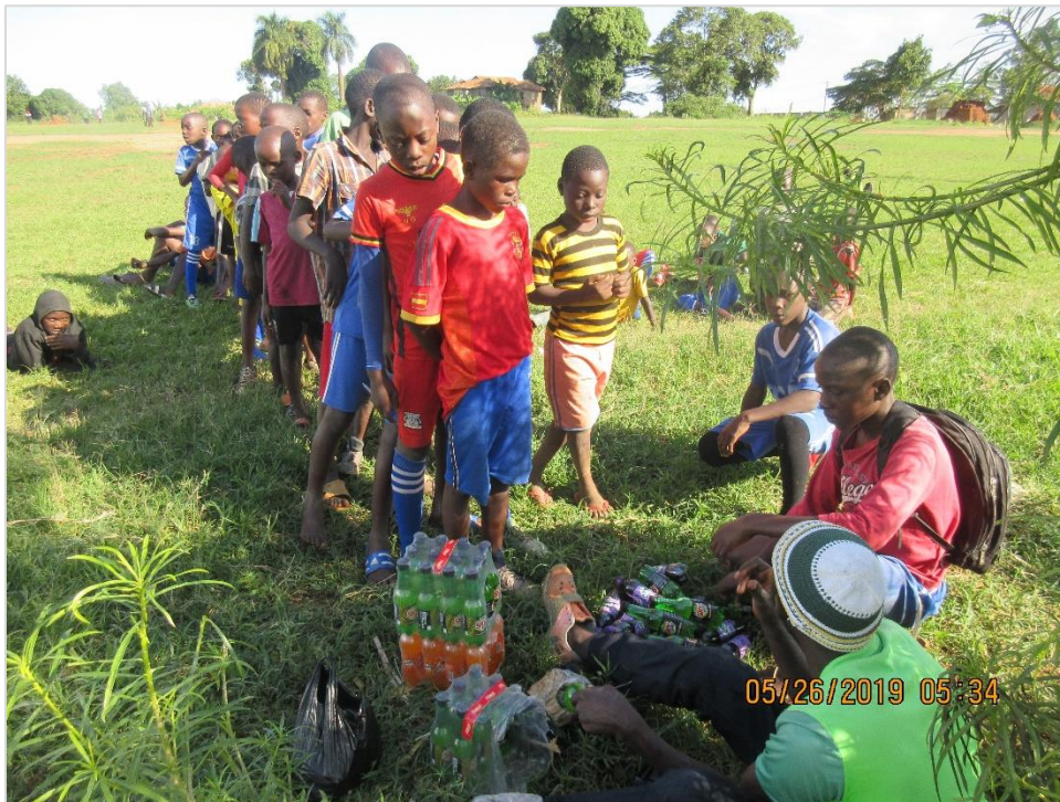
Children lining up to receive soft drinks organized for them