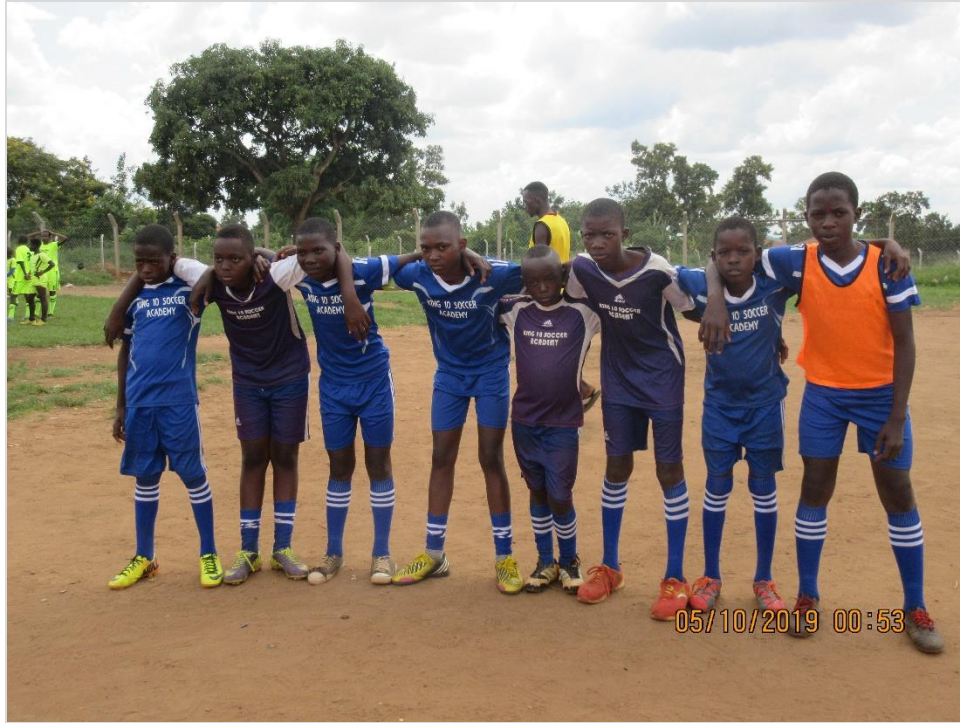
Under-13 Buwate boys during their match against King Tendo Soccer Academy