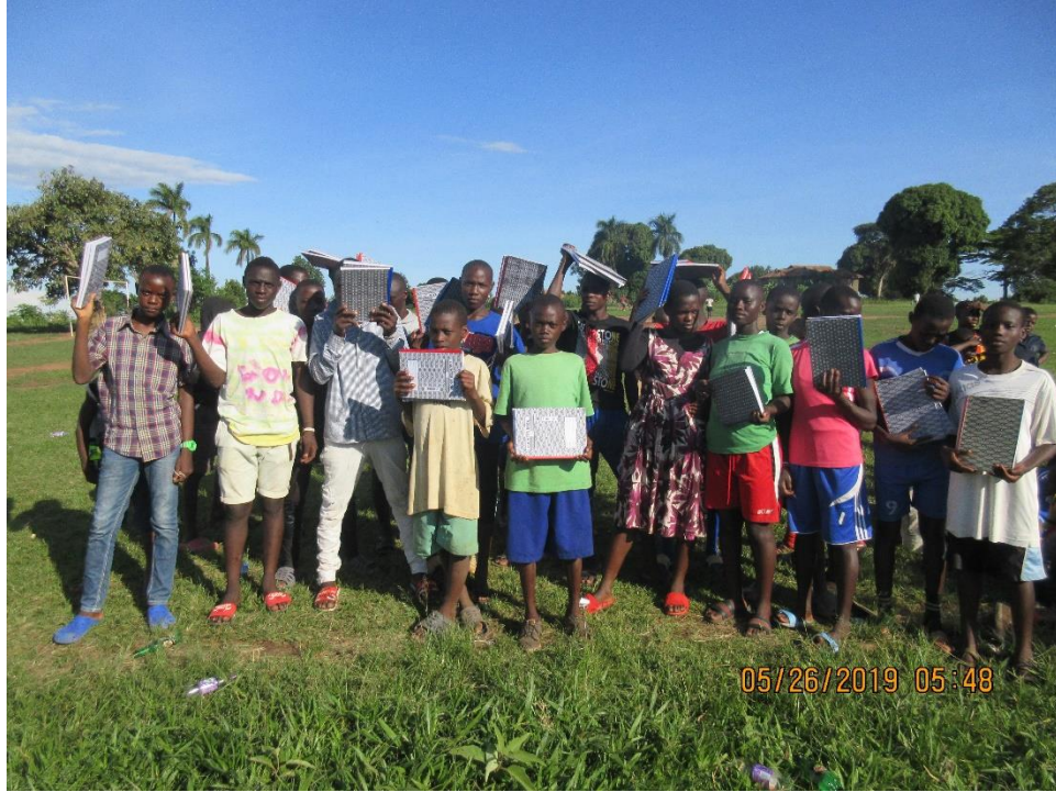
Group one after receiving their books for the second term