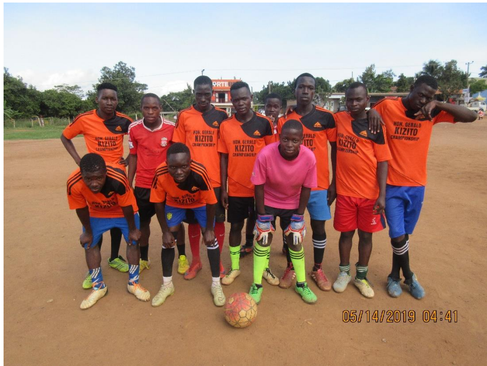
Team members of the visiting Butenga Football Club