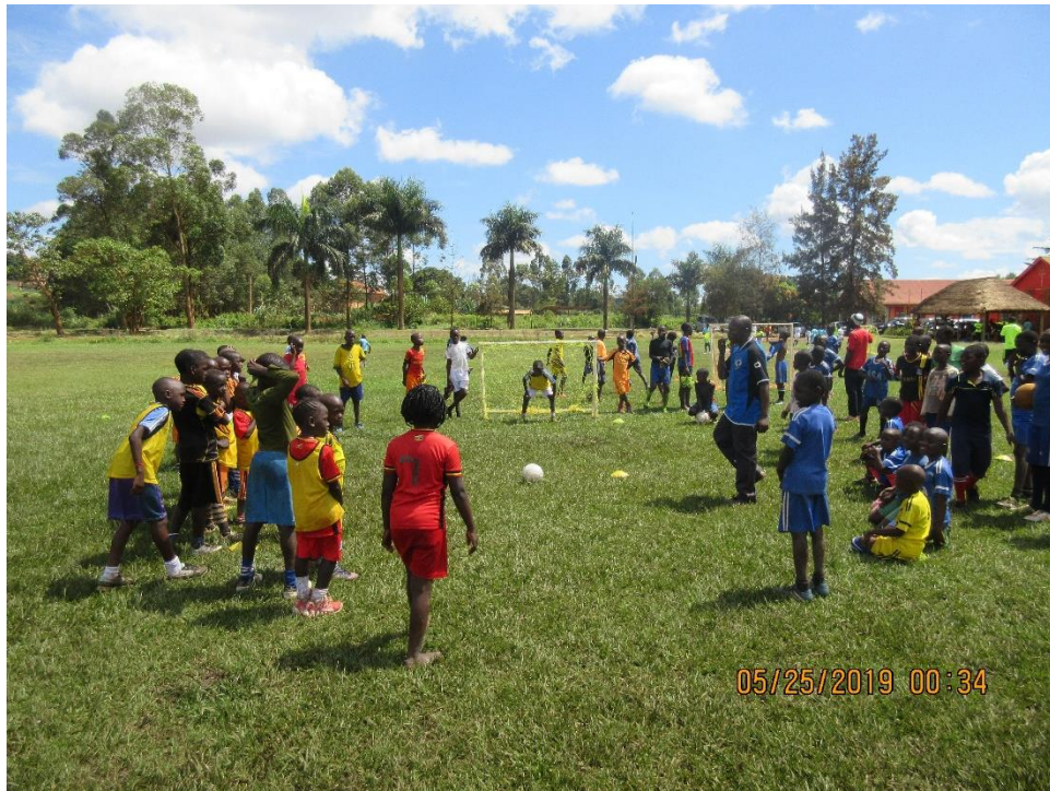
A Buwate girl taking a penalty shot