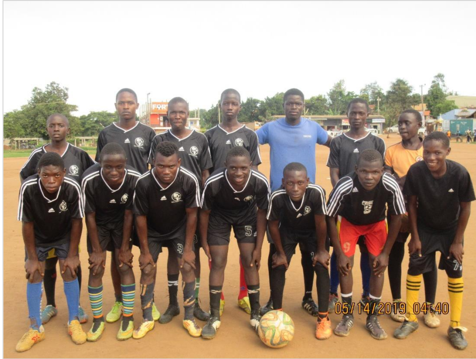
Under-17 Buwate boys before the whistle is blown to begin the match