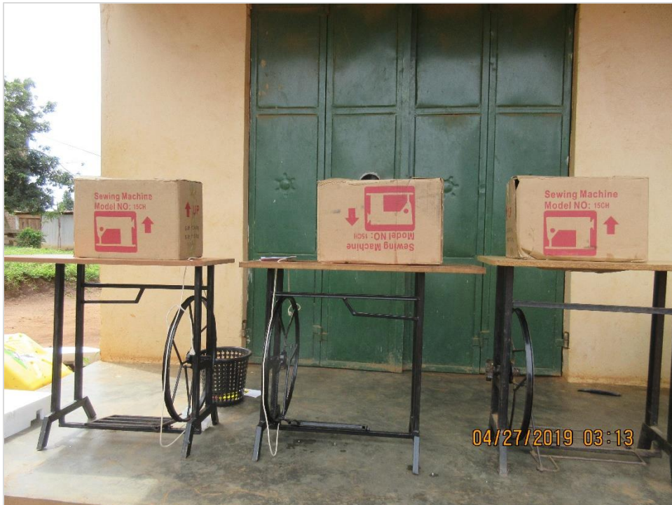
Sewing machines purchased for the tailoring department