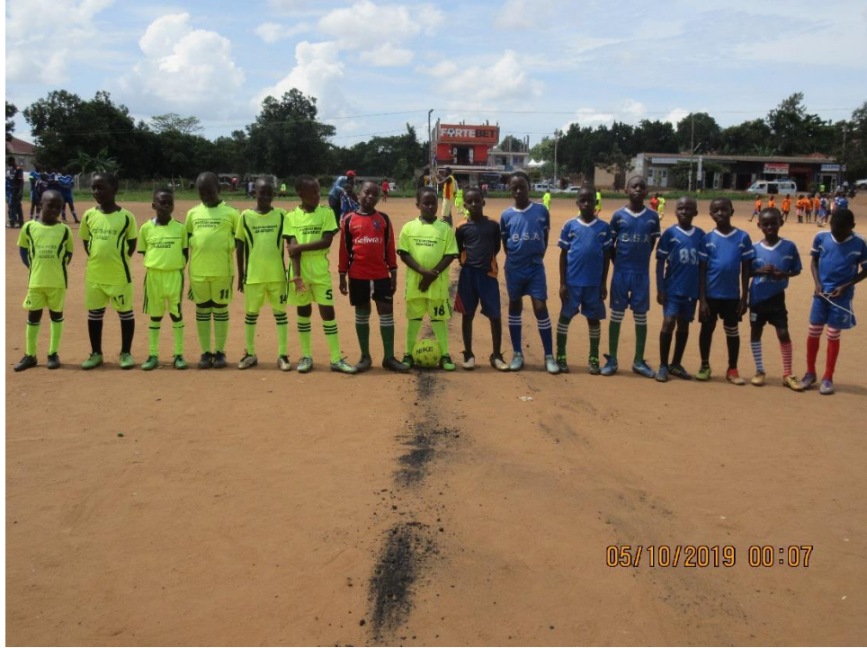
Under-11 Telstar Kira Soccer Academy and Buwate boys before the match