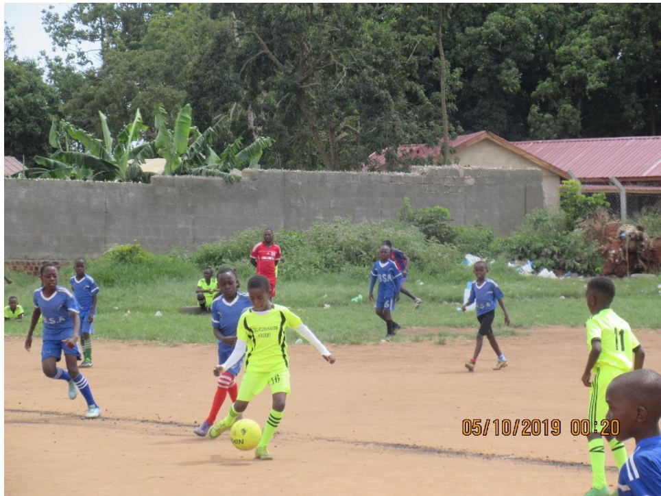
Playing under strict observation by the referee