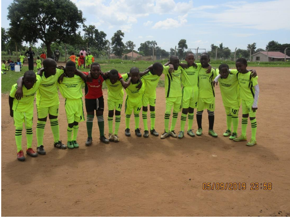
A team from Telstar Kira Soccer Academy