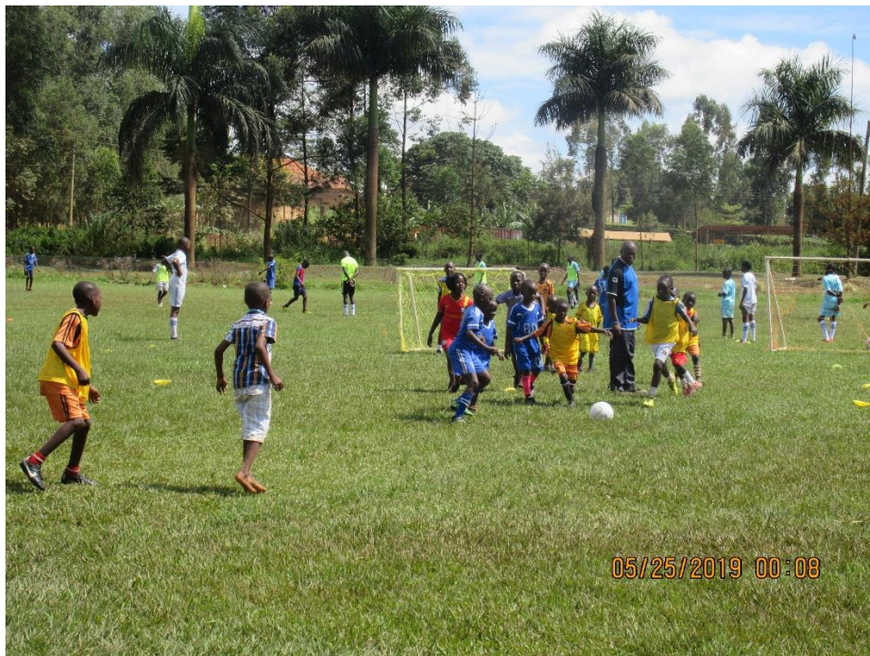
The under-9 team in a match after hearing the rules of the game