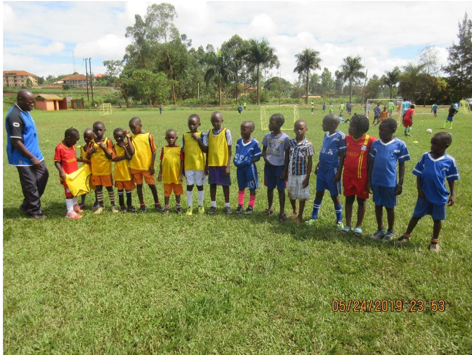
Organizers taking time to interact with the children