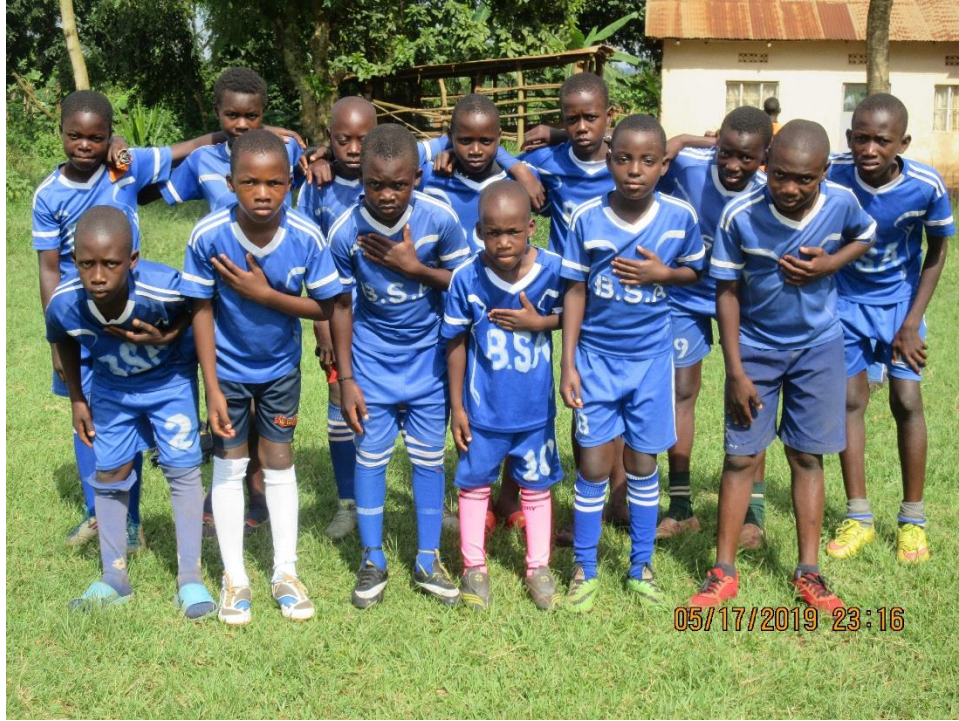
Under-9 Buwate children before they face Kikutukwe Soccer Academy