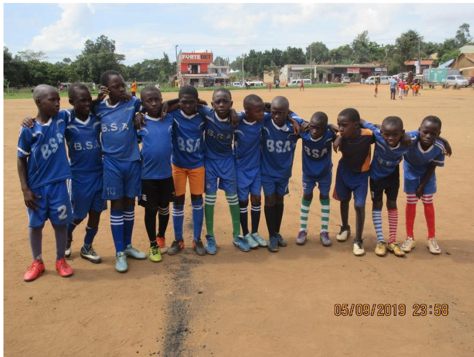
The under-11 Buwate boys ready for the games