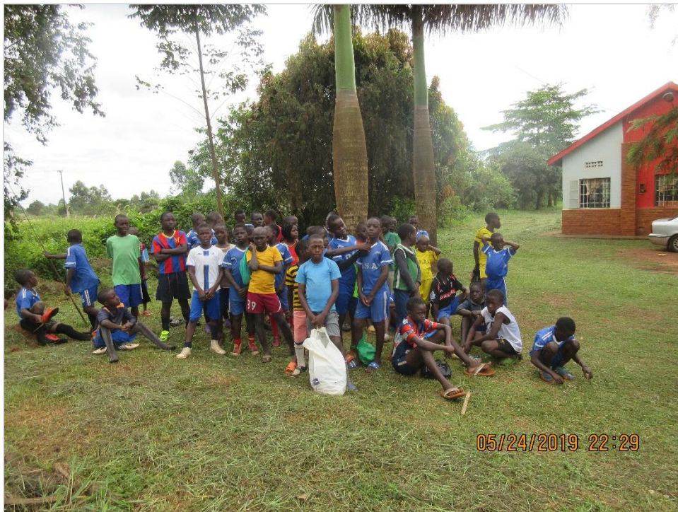
Buwate boys and girls on arrival in Kyabala for a friendly match