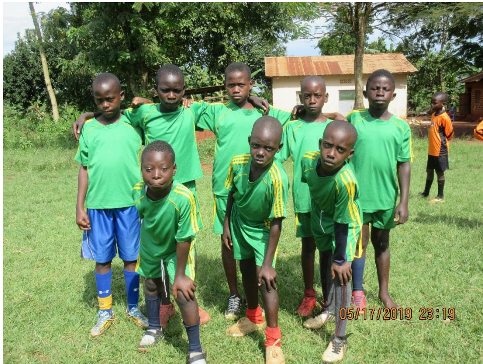
Under-13 Buwate children played a 1-1 draw match.