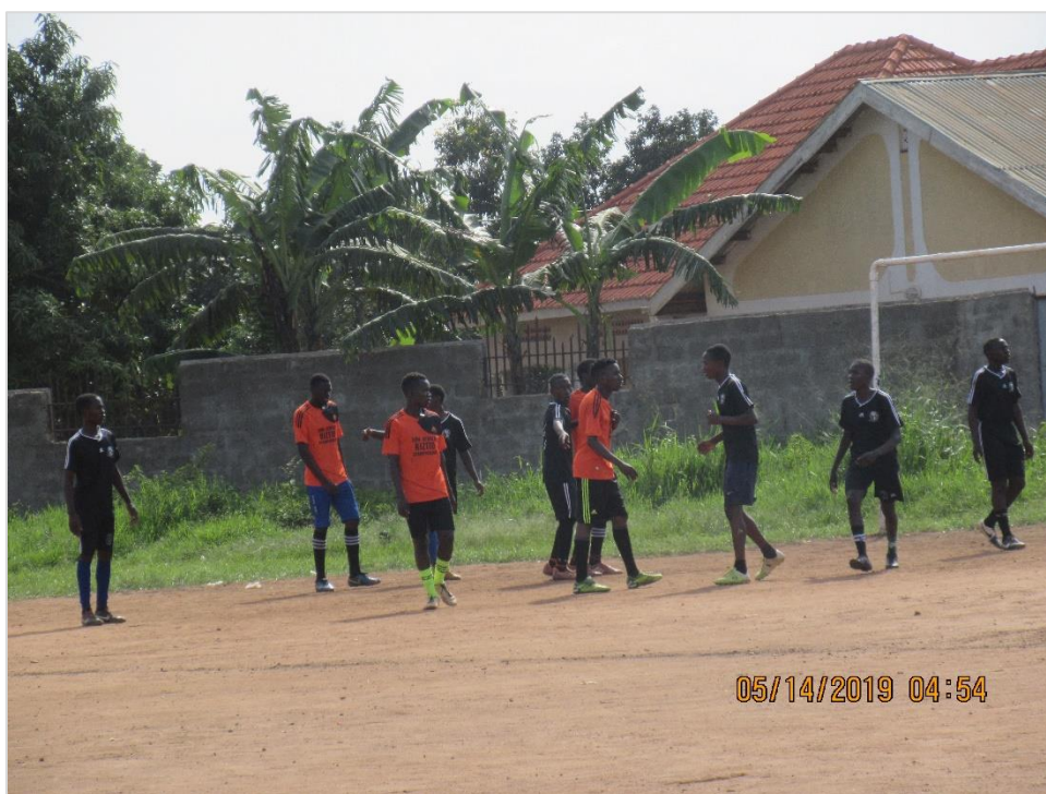
Pressure mounting as Buwate prepares for a corner kick