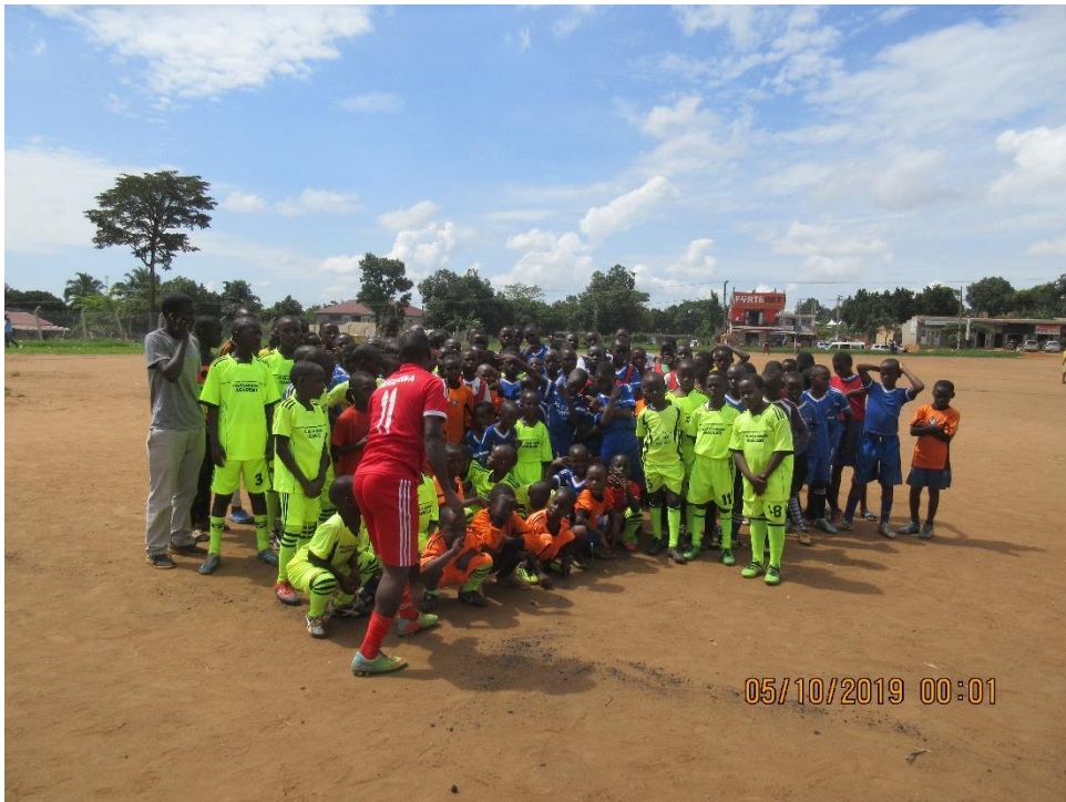
All invited teams, referees, and coaches gathered together