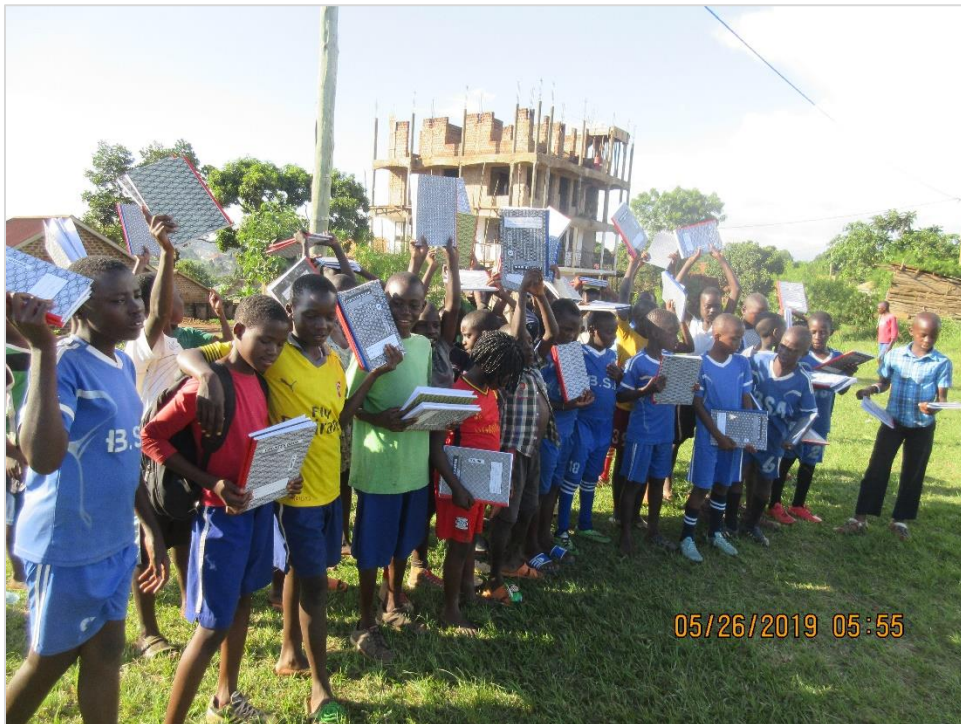
Group two lifting their books to signal they're ready for the second term