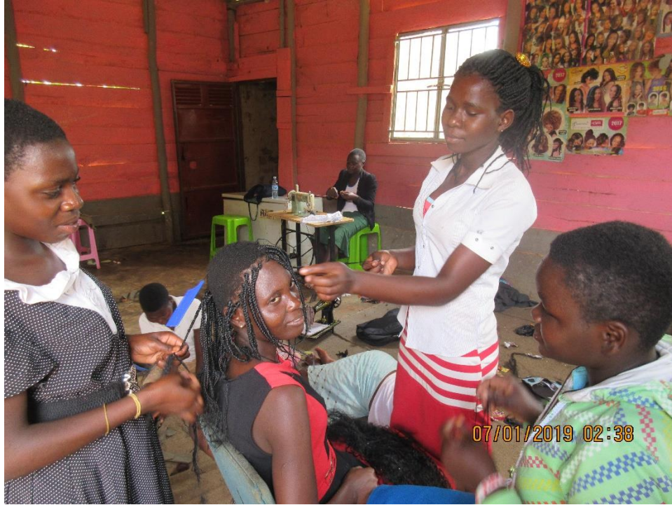
Girls learning how to braid hair in the hairdressing department