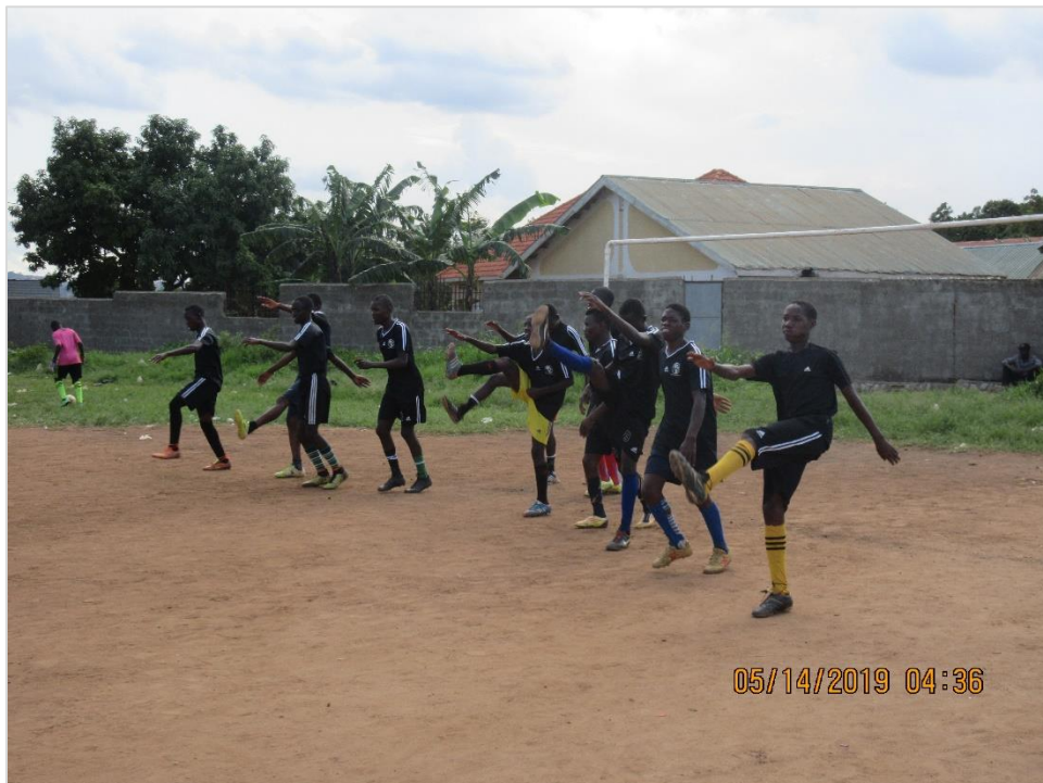
Under-17 Buwate boys in a simple exercise before playing against Butenga Football Club